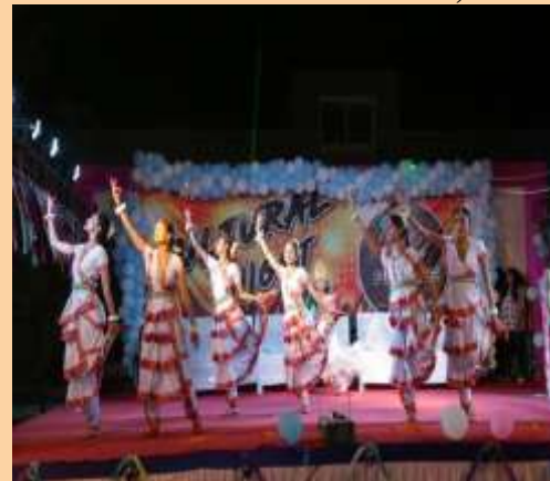
Annual Cultural Events