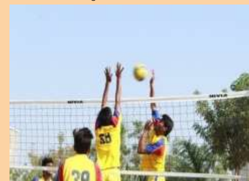
Annual Sports Events