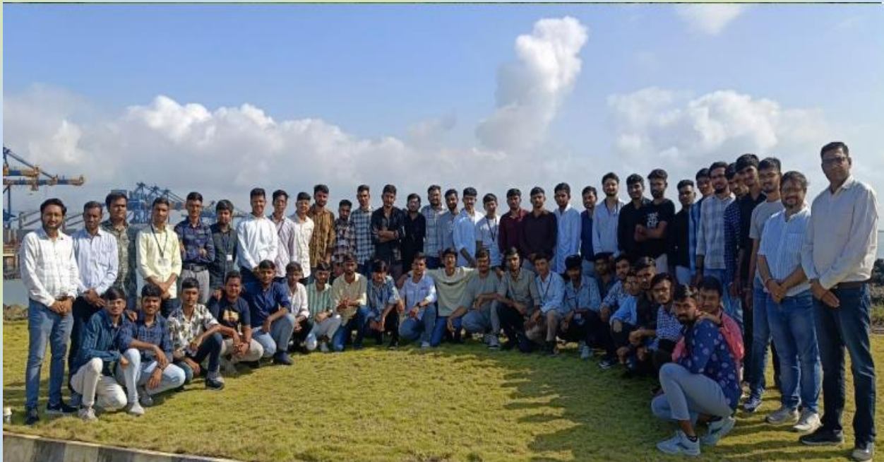
Group Photo at Adani Port